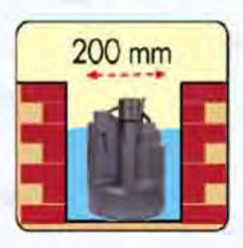
Ideal for limited space.

The ComPac Flotec pumps for clear water are designed to drain domestic water containing particles with a maximum diameter of 5 mm, empty and dry flooded rooms, draw water from wells, basins or cisterns.