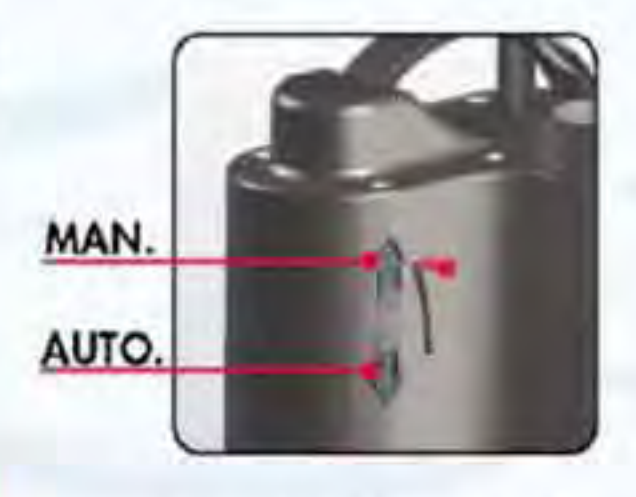
Automatic and manual mode.