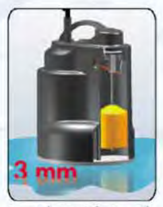
Integrated automatic floating switch. Draining level. 3mm with manual mode.