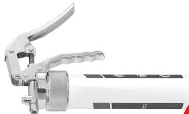
Lube-Shuttle® Grease Gun Pistol Grip HOL0199

Lithium grease for automotive use where multi-purpose grease is required for wheel bearings or chassis lubrication. Also great for lubricating construction and mining equipment where greased components are subjected to continuous heavy or shock loads.