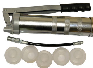
Multi Grease Gun Side Lever HOL0125

For 400g Lube-Shuttle® type cartridges. Comes with 12" Nylon Hose and 4 JAW coupler. Features a Hose Park to avoid contamination. Adapter for Lube Shuttle.